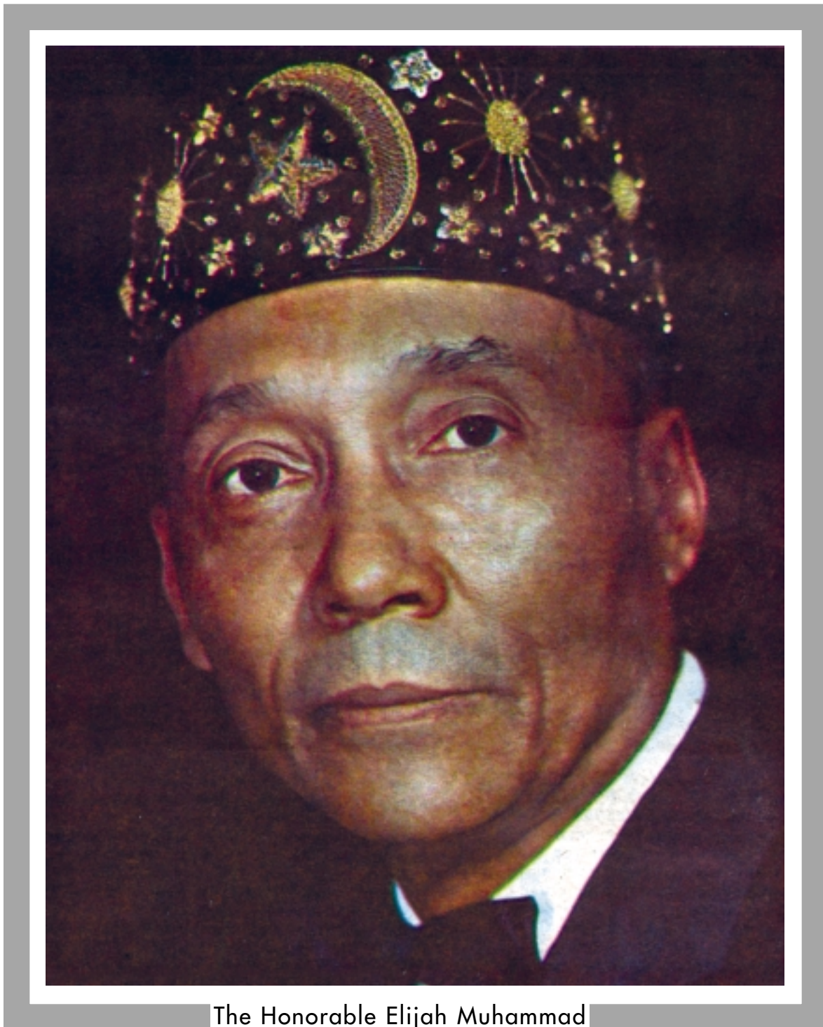
The Honorable Elijah Muhammad

Under such schooling system we believe we will make a better nation of people. The United States government should provide, free, all necessary text books and equipment, schools and college buildings. The Muslim teachers shall be left free to teach and train their people in the way of righteousness, de-